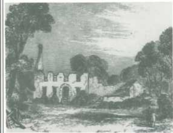
● THE BIRTHPLACE OF OLIVER GOLDSMITH