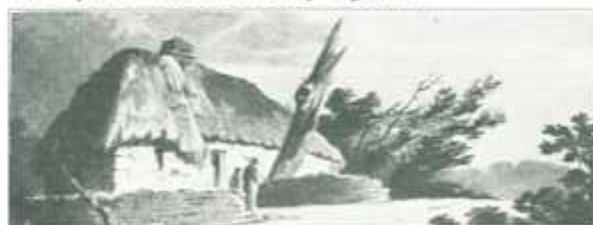
● THE SCHOOL HOUSE