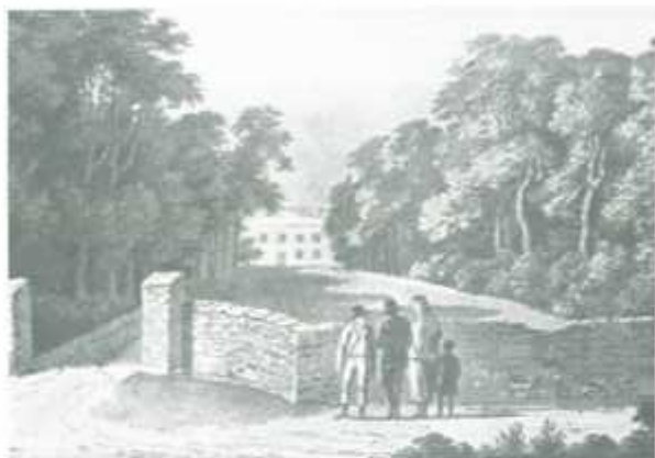
● THE PARSONAGE

The Organising Committee (in conjunction with the Goldsmith Society) invites you to attend the Fifth Summer School on Whit Weekend, Friday 2nd June, to Monday, 5th June, 1989.