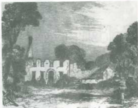
● THE BIRTHPLACE OF OLIVER GOLDSMITH

THEME: THE STAGE IRISHMAN IN POLITICS, LITERATURE AND EDUCATION