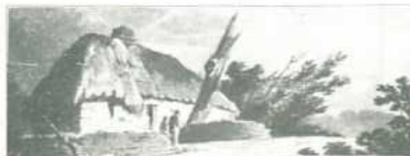
● THE SCHOOL HOUSE