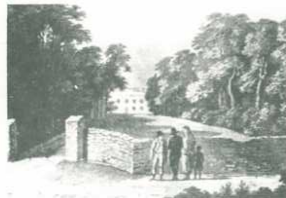
● THE PARSONAGE