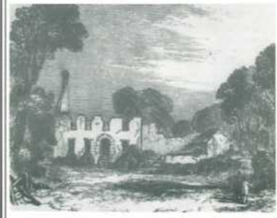
● THE BIRTHPLACE OF OLIVER GOLDSMITH