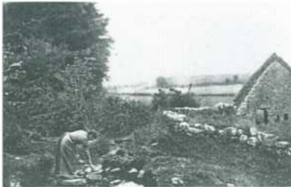
● "THE NEVER FAILING BROOK, THE BUSY MILL"

The Organising Committee (in conjunction with the Goldsmith Society) invites you to attend the Seventh Summer School on Whit Weekend, Friday 31st May, 1991, to Sunday, 2nd June, 1991.