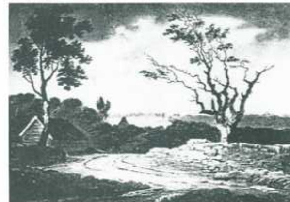
● HAWTHORN TREE

5.30 p.m. Traditional Irish Music and Song.