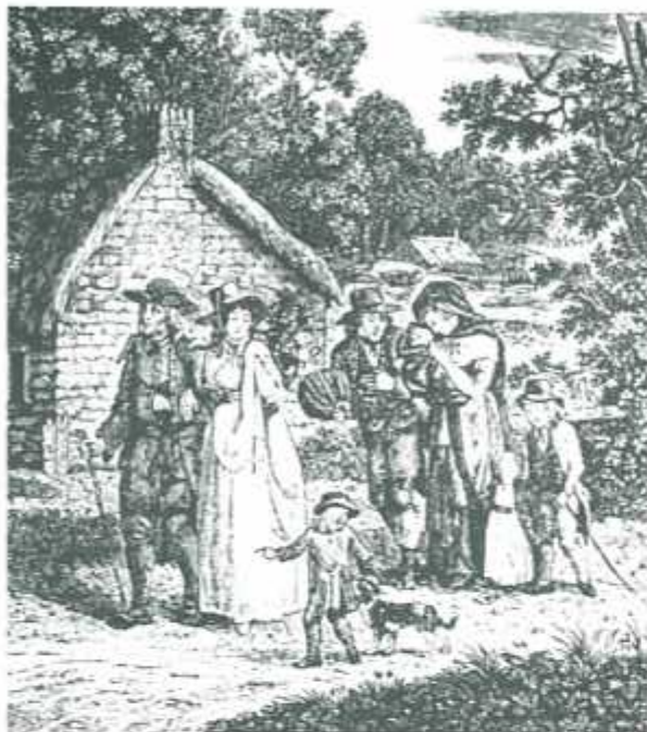
● THE DEPARTURE