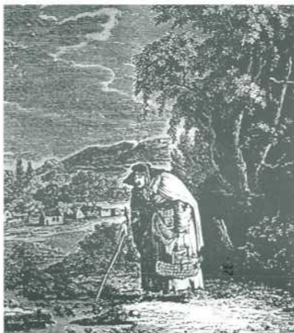
● THE WATER-CRESS GATHERER