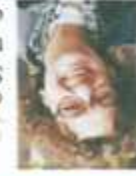
Ruth Dudley Edwards

He is a son of Brian Lenihan, former Taoiseach and a Minister in various portfolios who was a Dail deputy for Roscommon-Letcham 1961-73 and for Dublin West 1977-95. He is a brother of Conor Lenihan, Dail deputy for Dublin South-West and a nephew of Mary O'Rourke who was a Dail deputy 1982-2002 and who held various ministerial posts. He is a grandson of Patrick Lenihan, Dail deputy 1965-70.